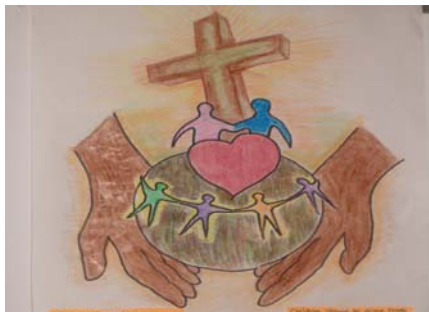
What is God's intention for the children?