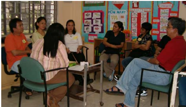
Project partners' staff meets monthly for sharing and updating.

The Project Rhoda Coordination Committee composed of the partner churches' coordinators met in September and October to chart the next round of project life. The 4 church partners are bent on increasing the number of children to be helped