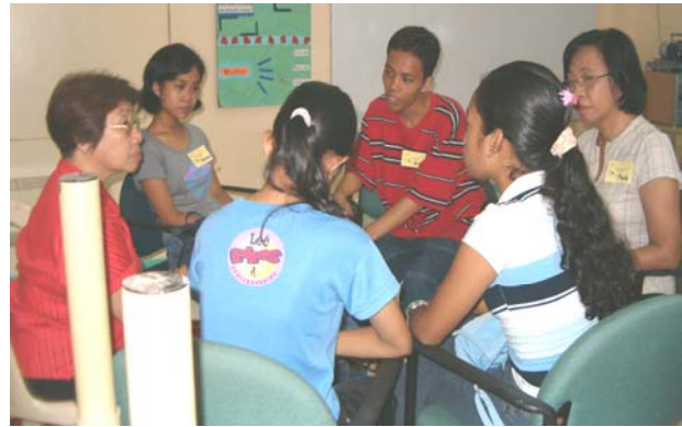
Focused group discussion with the Project Rhoda children participants