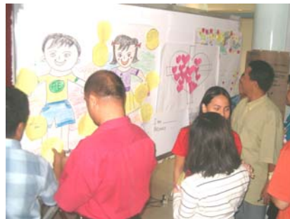
What is my role in fulfilling God's intention?

Understanding God's Heart for Children is a process of Bible-based reflection and consultation that seeks to enable Christians to hear and understand God's heart and will for children. Initiated and developed by Viva Network in UK , the process entails asking questions, such as those above, and finding the answers from the Scriptures and from our personal and collective experiences as children (which were before and even now as God's children) and from our interactions with the children today. By participating in the process, we have the opportunity to reflect on the basis and motivation of our work with children. We hope that it will inspire and guide us to increased action and greater effectiveness in the huge and challenging task of ministering to children especially those at risk.