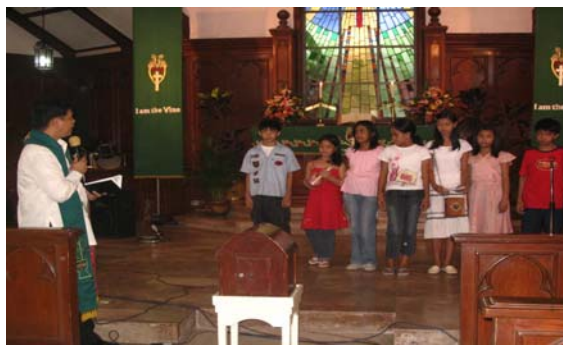
Officers of the Tangos United Methodist Children's Fellowship were installed during the church's Children's Sunday celebration last October 29, 2006.

The program is part of the Tangos UMC-Children's Ministries' objective to strengthen children's participation in the church's life and ministry and under the Nurture Ministry's general objective to help the children grow in faith.