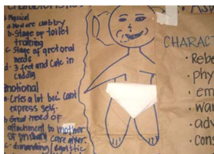
What is a child to me?