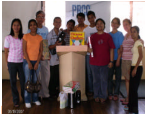
Pastors, center volunteers and PCMN staff posed after the launching celebration of the KNL Center for Children & Youth at Risk.