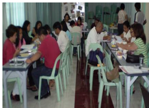
Workers in the Celebrating Children Course.

Activities include base lining on Child Trafficking and Retrospective Study on Project Rhoda and other network initiatives.